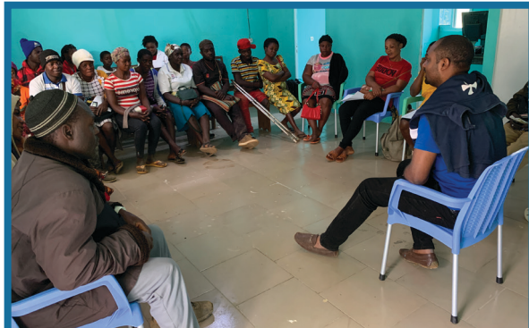
Open conversations among caregivers in Fundong District Hospital

Heartening confessions emerged from the participants. Open communication emerged as a key theme. Many adolescents admitted to a previous lack of knowledge and expressed increased openness to discussing concerns related to SRH.