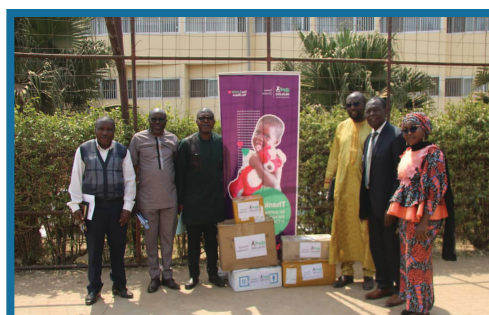
HHI donated equipment to MBH for Fistula repair