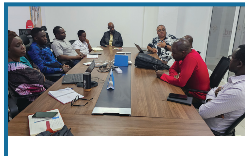
SEEPD Program Manager sharing experiences of CBC Health Services in disability work

Staff members of the CBC Health Services' Comprehensive Program for Empowerment of Persons with Disabilities and Inclusive Access to Basic Services of Health and Education in the Northwest region of Cameroon have carried out weeklong learning and exchange visit to Rwanda. The exchange visit enabled the team to visit a similar project initiative funded by CBM in some provinces in Rwanda.