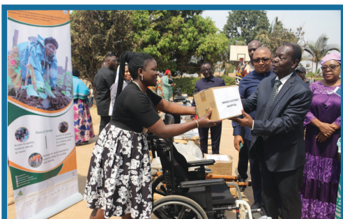
DHS handing equipment to hospital representative