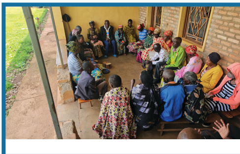
Meeting with VSLAs