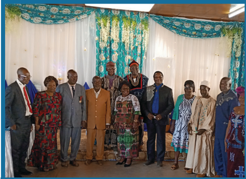
Batch of BBH retirees for 2022 & 2023