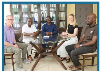
Visiting team being received by the DDAF