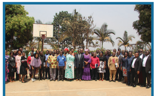
Stakeholders united in purpose