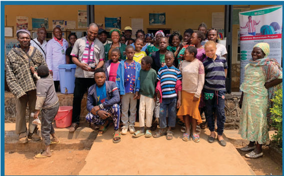
Belo Baptist Health Center participants in a joyful mood

Moved by the initiative, one father shared his distress: “My daughter with a mental disability started her period at school, but no one helped her. I felt helpless. This project helped me download an app to track her cycle, so I can be better prepared”.