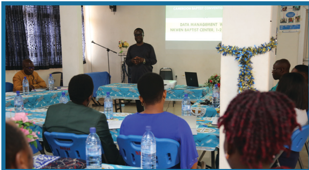
The DDAF addressing participants

The CBC Health Services currently collects, analyses and preserves data in many formats and will continue to improve, thanks to novel strategies employed and the active involvement of all stakeholders to facilitate the process.