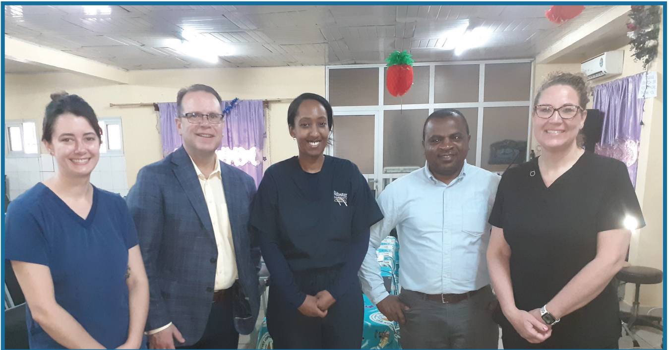
Facilitators from USA