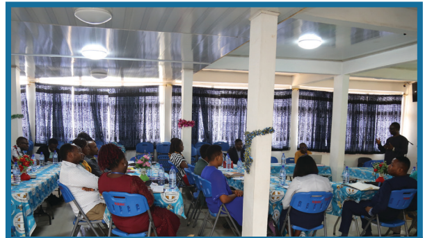
The DDAF tells participants that Data management is all encompassing in the CBCHS