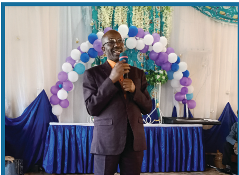
BBH Senior Administrator admonishing retirees on behalf of the Director of CBCHS

event that took place on December 9, 2023. The two in one event included a historic retirement of 14 deserved staff and the celebration of Christmas among staff, clients, caregivers and visitors. This period was celebrated under the theme, "Jesus, the Prince of Peace" .