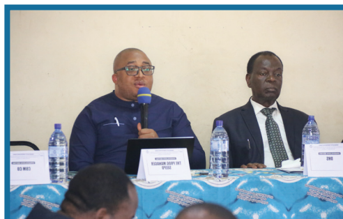
Program Manager presenting progress report