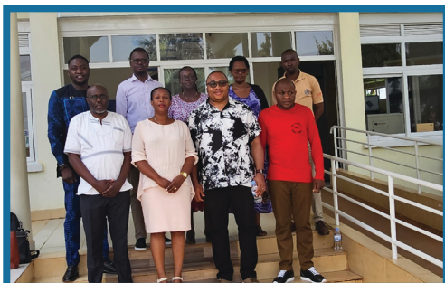
Both teams during the exchange visit