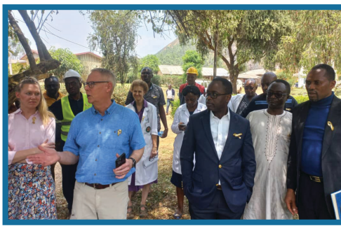
Tour of MBH to prospect suitable site for possible construction of Pediatric Hospital