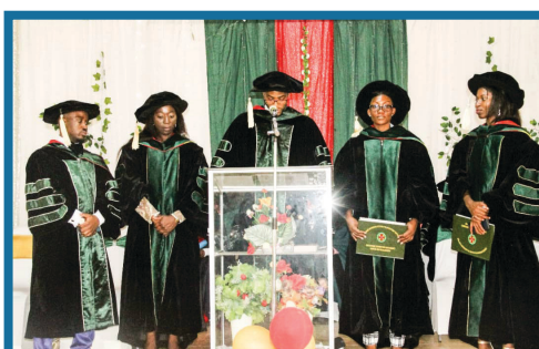
Newly Graduated CIMS Doctors In Joint Response