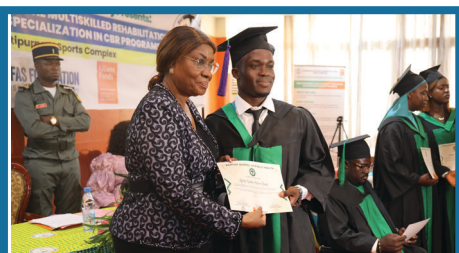
Award of certificates by H.E. the Minister of Social Affairs

The graduation of the first batch of Multiskilled Rehabilitation Technicians (MRTs) and Community-Based Rehabilitation (CBR) workers is not merely the culmination of a training program; it is the dawn of a new era in the landscape of rehabilitation services in Cameroon. Their expertise and dedication will undoubtedly make a profound impact on the lives of individuals with disabilities, creating a more inclusive and accessible society for all. As these graduates embark on their professional journeys, they carry with them the hopes and aspirations of those they will serve, empowered to transform lives and ignite a beacon of hope for a brighter future.