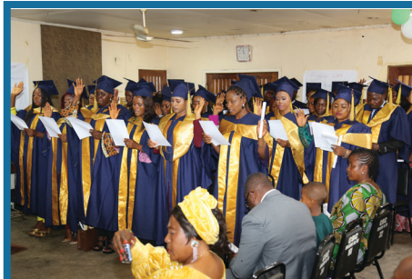
Graduating social workers taking the oath of confidentiality