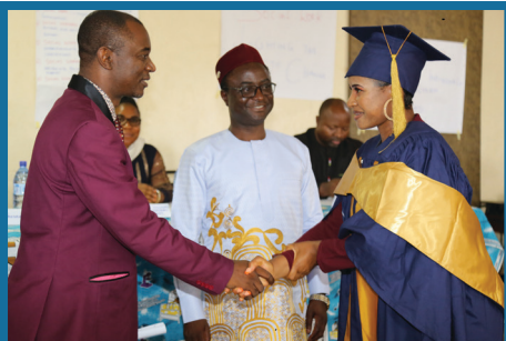
EP's representative awarding a graduand