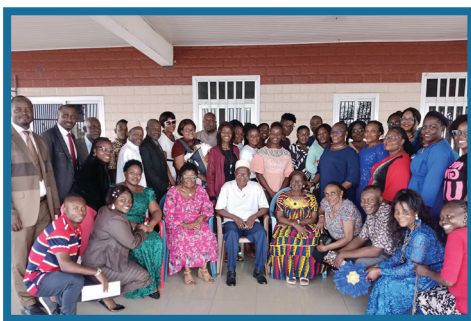
BHM nurses pose with CBCHS retirees in attendance (seated in center)

"To go above and beyond the call of duty, the first to work and the last to leave, the heart and soul of caring, who will pass through your life for a minute and impact it for an eternity". That is who a Nurse is.