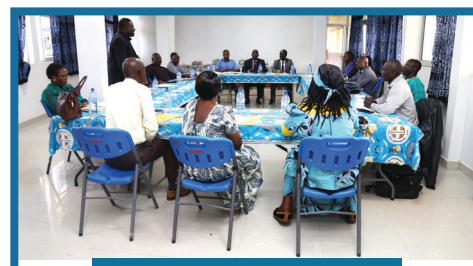
LAP Management Meeting in Session

The LAP, therefore, is the fore runner of CBC Health Services in Cameroon. Most of 'our' Integrated Health Centers and hospitals started under the LAP program.