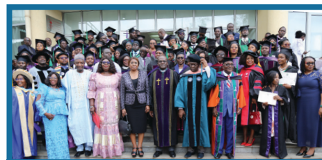
Family photo with the Minister of Social Affairs, Mme Pauline Irene Nguene, and her cabinet, CBC leaders and graduates