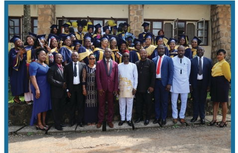
Social work graduands & officials