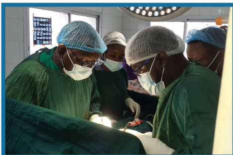
First surgery done by the Urologist surgeon at MBHD