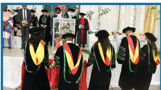
Prayer of Dedication By Belo Field Pastor