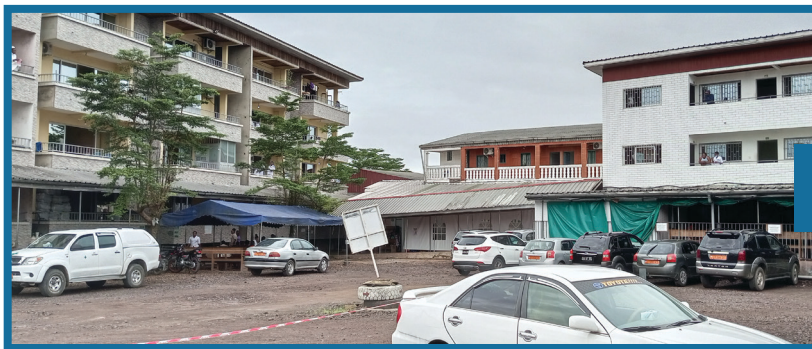
Bonaberi Baptist Hospital Douala