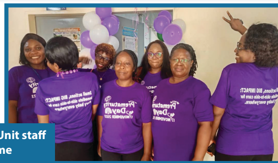
Noenatal Intensive Care Unit staff showcase this year's Theme

In honor of World Prematurity Day on November 17, Nkwen Baptist Hospital in Bamenda hosted a heartwarming celebration to recognize the resilience and strength of premature infants and their families. Celebrated under the theme, "Small actions, big impact, immediate skin to skin care for every baby everywhere," staff at the Neonatal intensive care unit of the hospital carried out sensitization talks on radio, at a Doctors seminar and among staff at chapel, all in a bid to raise awareness about the challenges and triumphs of preterm birth.