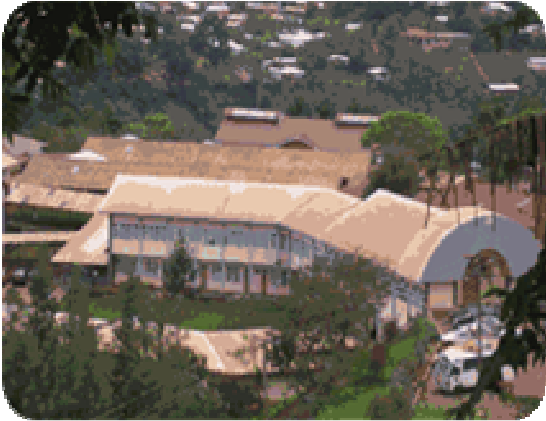
Bansa Baptist Hospital