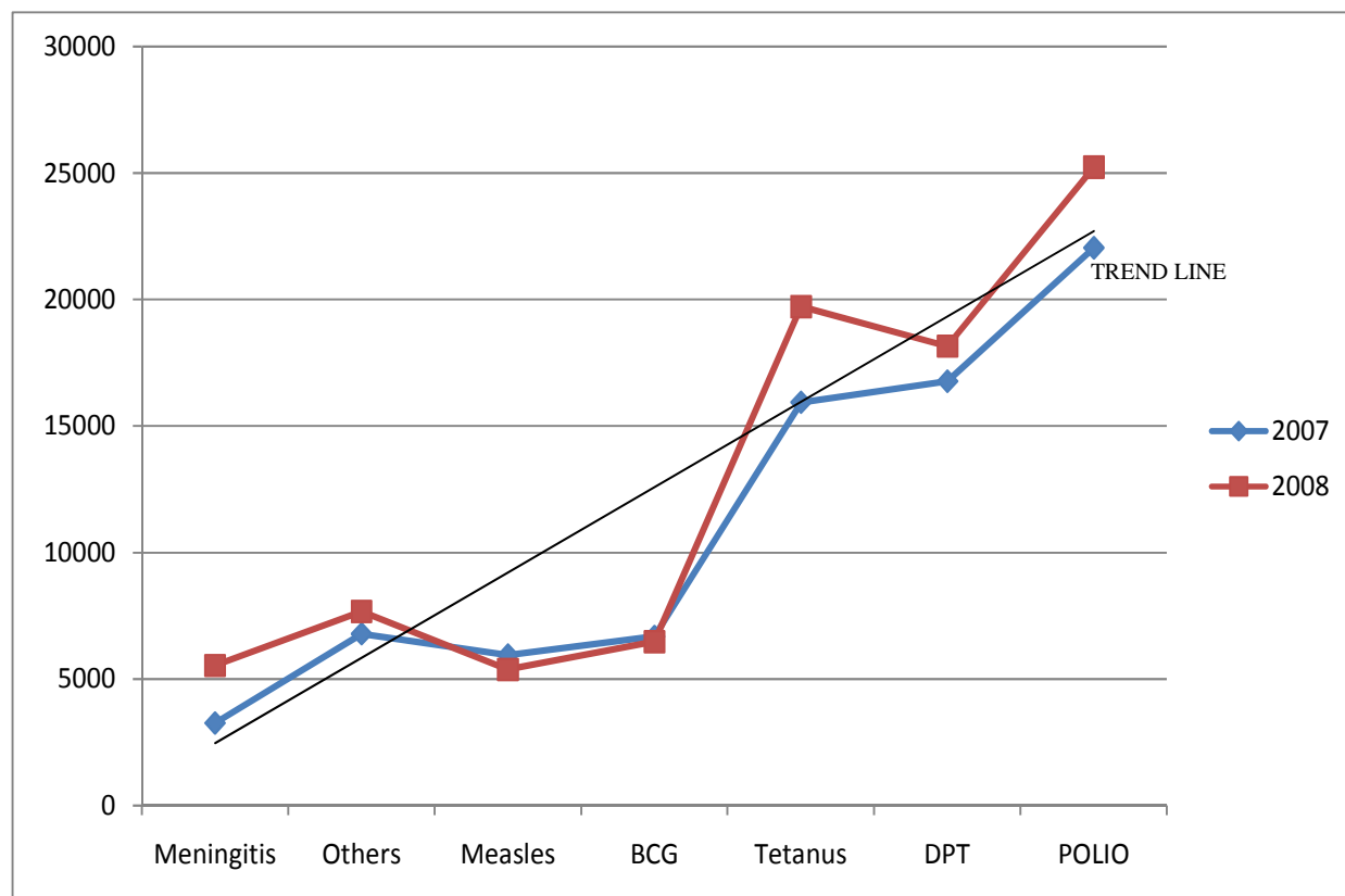
Fig 2: IMMUNIZATION for 2008 compared to 2007

Although some Vaccines witnessed a drop, overall immunization coverage in 2008 increased by 13.8%.