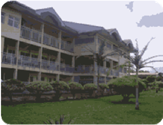
Mutengene Baptist Hospital