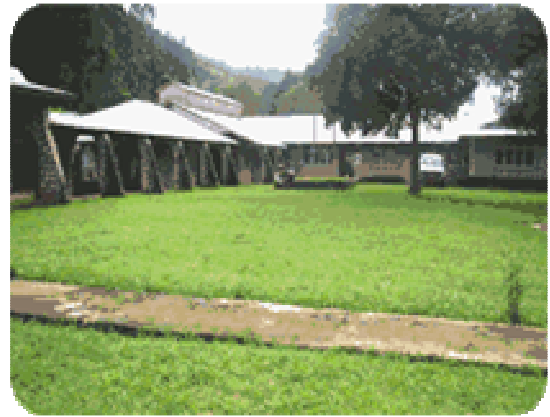
Dunger Baptist Hospital