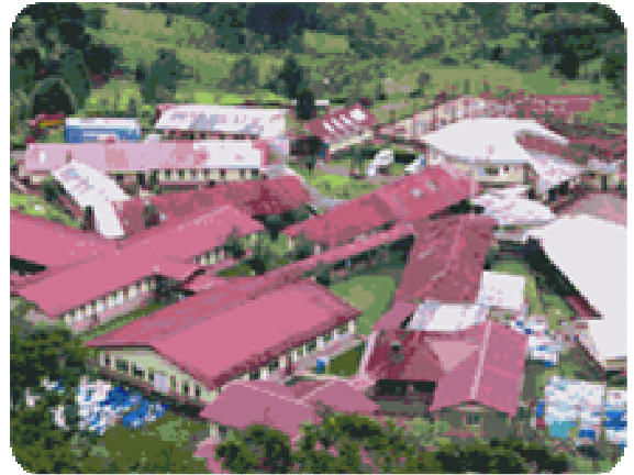
Mbingo Baptist Hospital