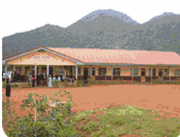
Banyo Baptist Hospital